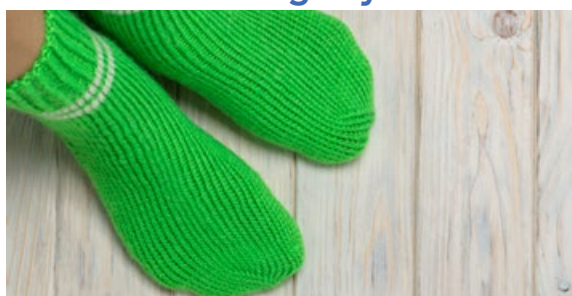
See page one.

No part of this newsletter may be used or reproduced in any manner whatsoever without written permission of the author. No expressed or implied guarantees have been made or are made by the author or publisher. Individual results may vary. Neither author nor publisher accepts any liability or responsibility to any person with respect to any loss or damage alleged to have been caused by the information in this newsletter. Always seek professional medical advice.